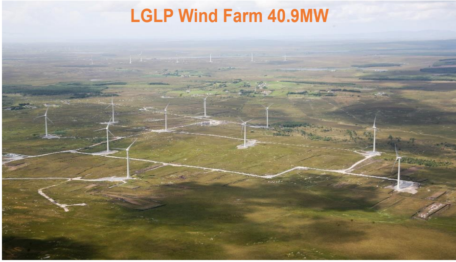
LGLP Wind Farm 40.9MW

Ireland imported 67% of its energy requirement in 2018, one of the highest ratios in Europe. The more of its own energy Ireland can produce, the less vulnerable it would be to foreign policy and conflict interrupting gas, oil, and electricity supply lines. There is an opportunity to continue developing a strong indigenous wind industry, that will take advantage of Ireland's excellent wind resource, reducing our import dependency.