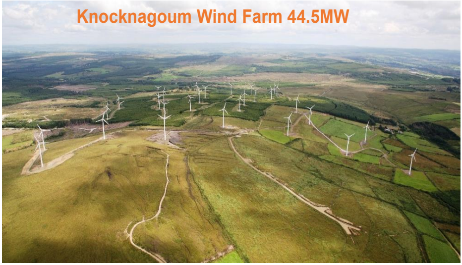
Knocknagoum Wind Farm 44.5MW